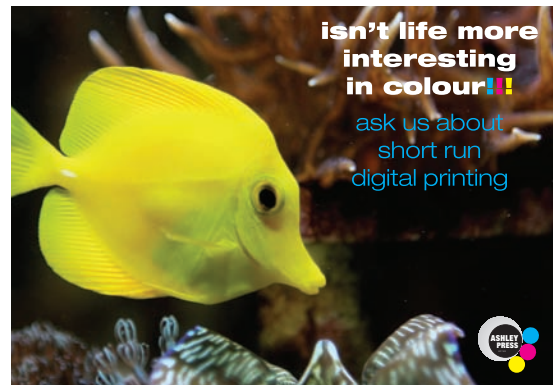
Example of what the job will look like once trimmed

Orange dotted lines depict your document size and where the paper will be cut, the image overlaps the edge of the document to give space for bleed. This Alleviates any possibility of the white of the paper edge showing after being trimmed.